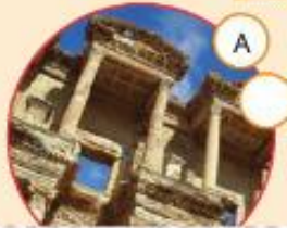
Open Air Museum