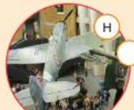
Military & War Museum